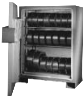
dryWIRE® 240/480V AC