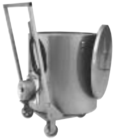
Type 100FX portable model