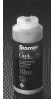
Part No. 63146

Highest quality, specially formulated, powdered chalk colored to mark distinctly. Lays down a hard, clean line that won't blow away. Available in easy-to-use plastic bottles with no-spill cap. For use in all chalk line reels.