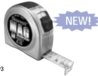
Part No. 66993