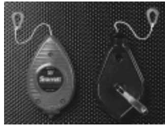
Part No. 63138, 63140

Chalk lines are available in a die-cast reel with a durable enamel finish or molded high-impact ABS black plastic reel. Exclusive slide-action lock and hook ring provide true plumb bob action. Lock releases automatically on rewind. Handle closes flush with the case. Leak resistant tip opens for quick filling with chalk. Supplied without chalk. Top-quality replacement lines on “pop-in” spool. Replacement lines also fit most other chalk reels.